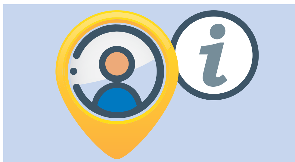
Follow the guidance and rules in your local area