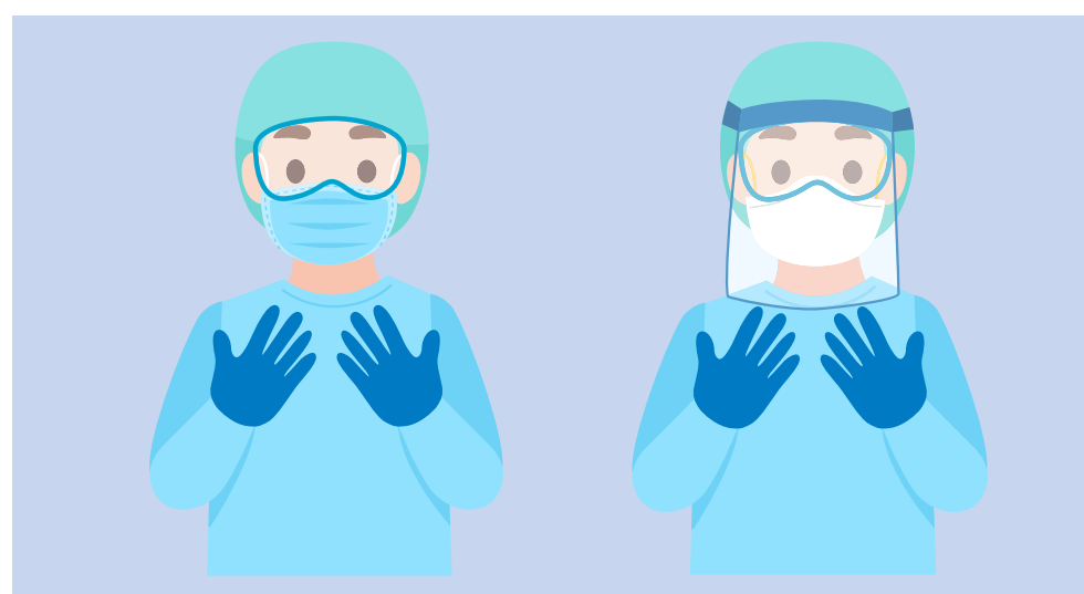
Wearing PPE and face masks