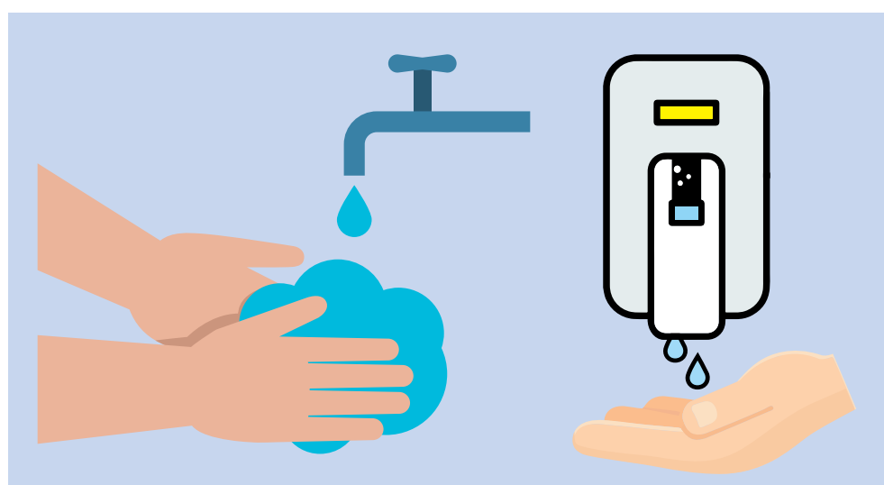
Cleaning your hands regularly and thoroughly